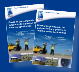
2010 French and Spanish editions 2005 Aerodrome Bird Hazard Prevention and Wildlife Management Handbook