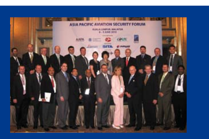
Asia-Pacific Aviation Security Forum co-organized with Asia Pacific Airlines Association in June 2010

APAC regional office is thankful to our members and industry partners for their unfailing support and cooperation throughout the year of 2010. Looking ahead, the APAC regional office is committed to providing more new services to better serve our growing membership.