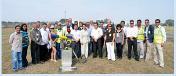
38th ACI Fund Seminar on Prevención Ante el Peligro de las Aves in Panama