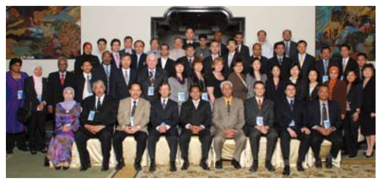
4th Steering Committee Meeting of CAPSCA