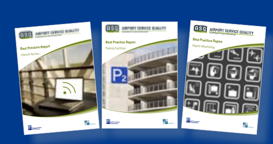
Airport Service Quality Best Practice Reports on Parking facilities, Internet access and Airport wayfinding.