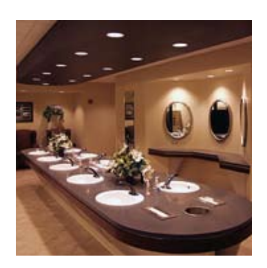
ACI Annual Report 2010

ACI World also delivered three 'Managing Service Quality at Airports' courses, under ACI Global Training, training 40 airport representatives in how to use the ASQ tools and manage service quality at airports.