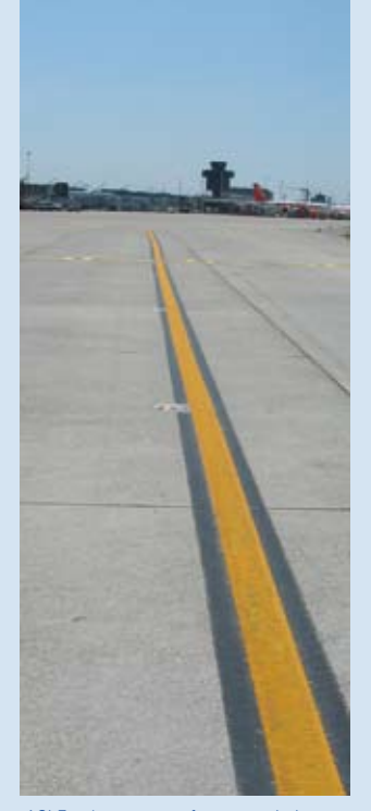
ACI Fund supports safety as a priority through ICAO Annex 14 courses