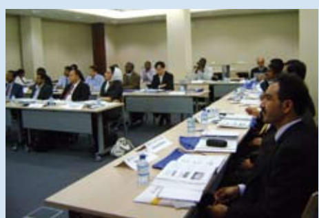
38th ACI Fund Seminar on Prevención Ante el Peligro de las Aves in Panama